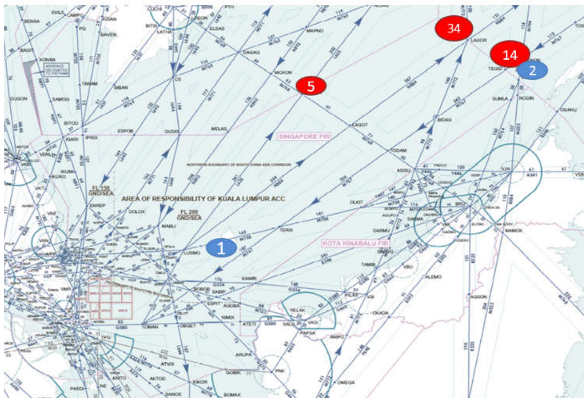
Figure 2: Geographical location of LLDs (Blue) and LLEs (Red)

The majority of the LLDs and LLEs were from CAT E - ATC coordination errors. There is also a growing trend of CAT B - Incorrect operation by flight crew or interpretation of airborne equipment. This is due to pilot providing inaccurate waypoint estimates. Such errors are usually caused by the frequent occurrence of weather phenomena in the South China Sea airspace that require aircraft to deviate from course thereby leading to inaccurate waypoint estimates. Lastly there are a group of LLDs and LLEs in CAT I – Others, that are shown to be within limits of ATC and pilot procedures but fall into the criteria of airspace deviation error. Such errors are still reported but are considered non-risk bearing for the risk assessment.